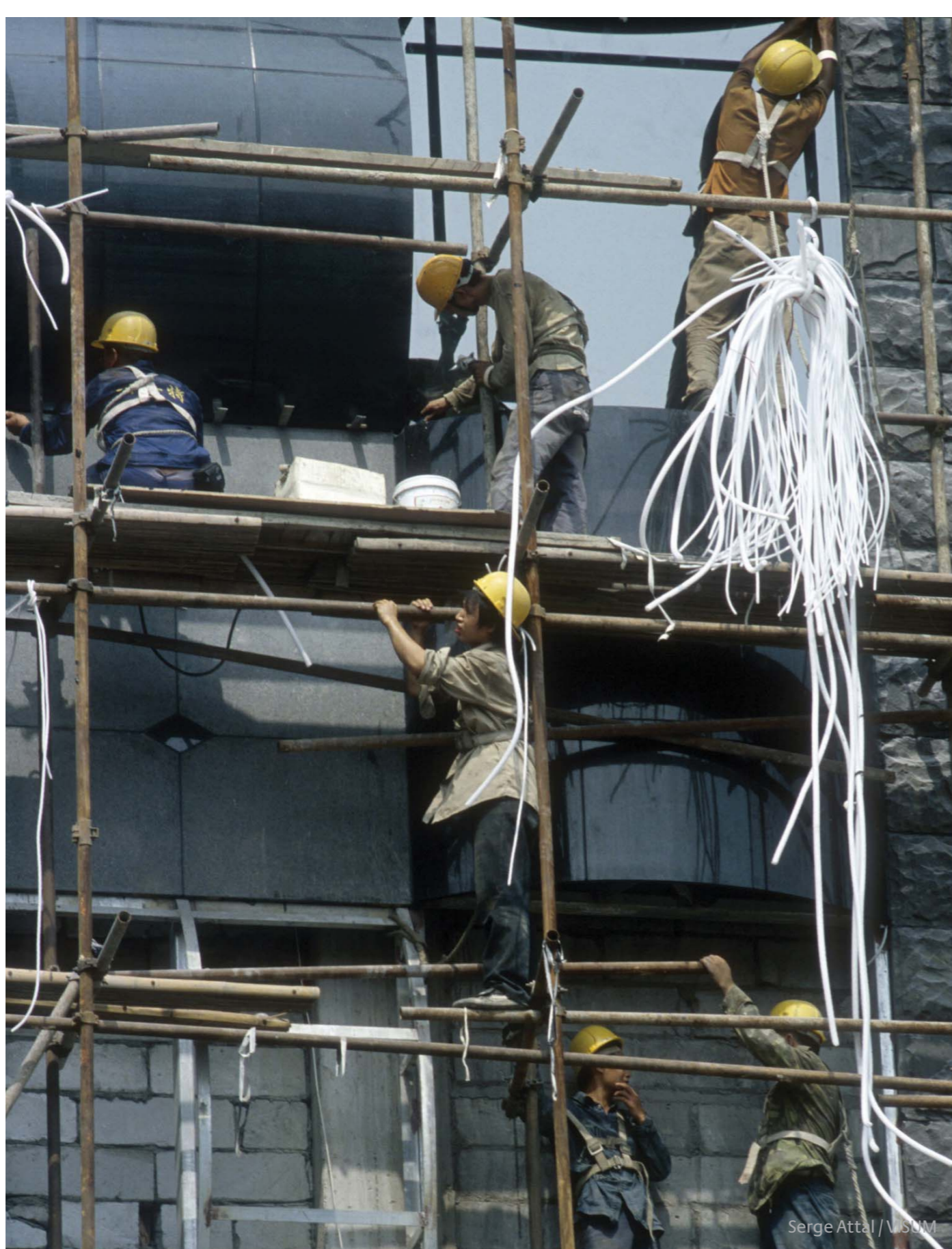
SergeAttal / USM

inWent Capacity Building International Germany