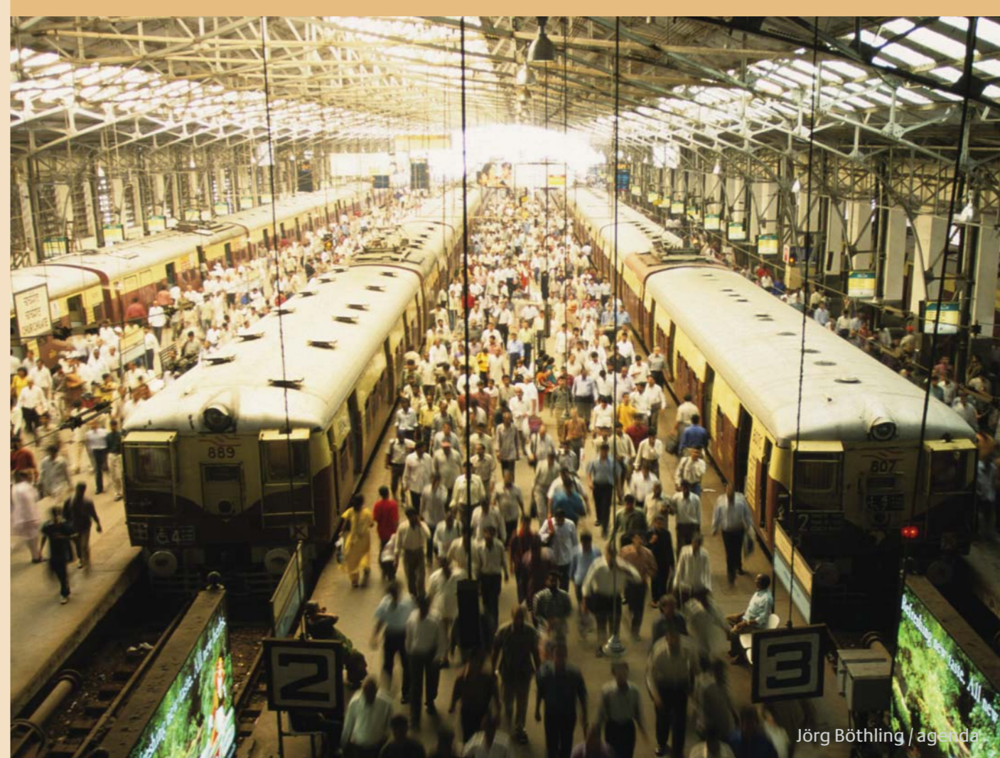
Jörg Böhling / agenda

The project "Borders and Urban Governance" project operates according to the hypothesis that border-drawing and the selective differentiation of the governance of urban subareas (“governance modes”) are used to ensure the governability of megaurban regions.