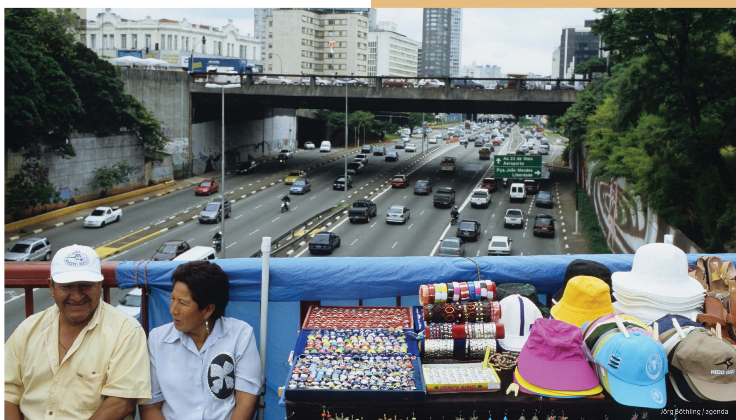
Jörg Böhling / agenda